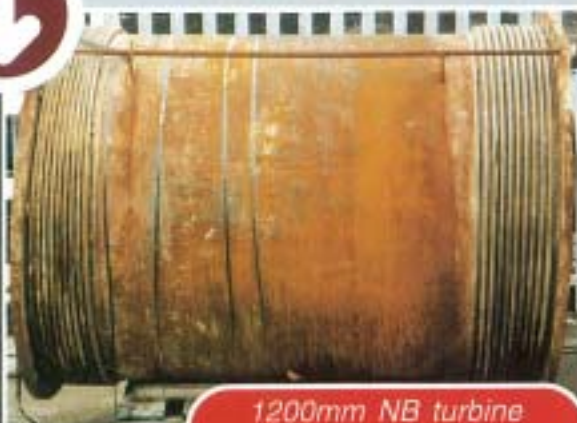
1200mm NB turbine exhaust bellows